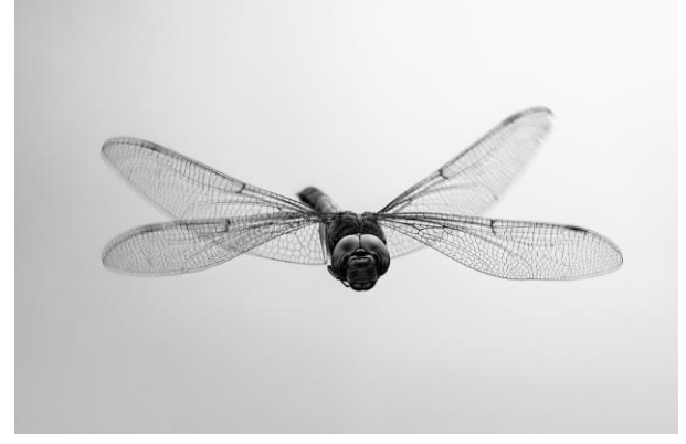
Norfolk hawker dragonfly in flight

July is the month for looking out for dragonflies and damselflies. There has been a big emergence of Norfolk Hawkers and Four Spotted chasers recently and now the Black Tailed skimmers are coming out too.