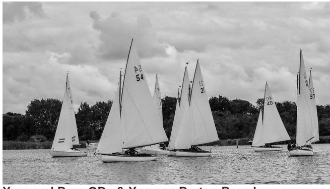
Yare and Bure ODs & Yeoman Barton Broad

The Norfolk Punt Club, situated in the middle of the idyllic Barton Broad, now has some 360 members with a wide range of boats including Yare and Bure One Designs and Yeoman keelboats, which are well represented at the moment, but all types of dinghies and keelboats are owned by members.