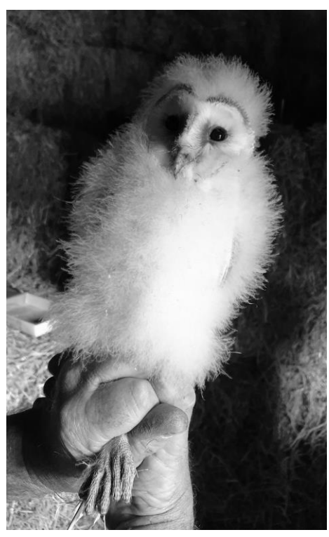
Barn owl chick being ringed

Sadly, many young owls do not survive their first winter as they succumb to starvation when hard weather conditions mean they struggle to find food and many become victims to road collisions especially when they pop over low hedges in front of vehicles.