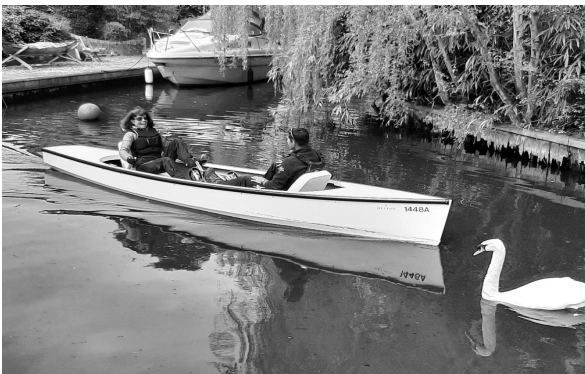
Gliding along Limekiln Dyke in a pedal launch

The pedal launches are a great way for two people to cruise quietly along, enjoying the water, wildlife and some gentle exercise at the same time. We have discovered that these are particularly good boats for people with hearing difficulties, as you face your instructor or companion when paddling so lip-reading is easy.