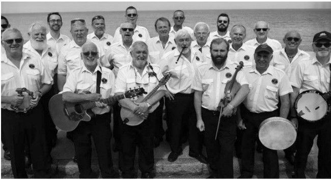
Sheringham Shantymen 2019

Postponed from 2020, the NVH Events Committee is delighted to present a very special evening with the Sheringham Shantymen with 'Songs of the Sea' on Saturday 16 October 2021 – doors open from 7.15pm. Tickets are £10.00 including nibbles and tea/coffee served in interval. Licenced bar for drinks throughout the evening. Raffle too!