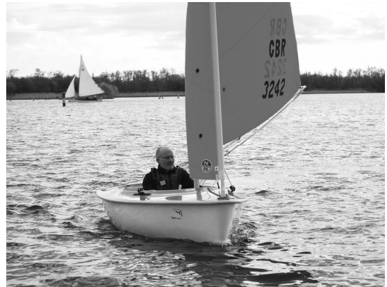
Hansa 303 'Orange' on Barton Broad

The Hansa dinghies are in fact small keelboats designed specifically for people with mobility challenges and are quite ubiquitous at Sailability centres around the world. We have been training our instructors on these over the last couple of months and have already been able to put complete novice sailors in them, on their own, to enjoy safe and independent sailing. They are around 10ft long, very simple to rig and sail, as well as being very colourful. You may spot them out on Barton Broad with their orange, lilac and lime coloured sails.