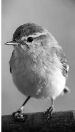
Chiffchaff

In my notes for March, I usually tell you to listen out for the first returning migrant warbler, the Chiffchaff which starts to sing its distinctive chiff-chaff call towards the end of the month. It has always been a welcome sound of spring and something which every bird watcher listens out for. Now however due to climate change an increasing number of chiffchaffs are staying in the UK to over winter