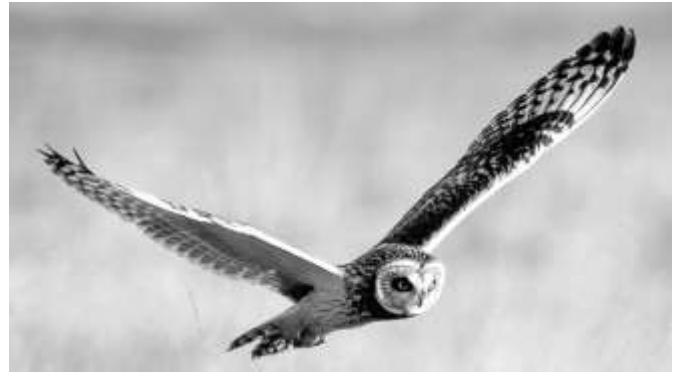
Short Eared Owl

rather than risk the danger of a long migratory flight. They are insect eating birds so tend to be in the south west of England and often favour the locality of sewage farms where there is enough insect life in the form of midges to see them through the winter months. The RSPB estimate that there are around 1,000 chiffchaffs over wintering but this is likely to be an underestimate. In January I noticed a chiffchaff feeding amongst the willows at the boardwalk platform, the bird advertising its presence with its high-pitched contact calls. On the 14 th February, much to my surprise, I was at the boardwalk platform again when I heard the unmistakable sound of a chiffchaff singing from the woodland and then later saw a chiffchaff feeding near the platform. Only twenty years ago it would have been unthinkable that such small insectivorous birds would be able to survive our winters. Who knows if this is a change in the strategy of the chiffchaff or just a trend? There has been some interest in the local media recently about some short-eared owls at Winterton which have been hunting there in the dunes. Whilst these winter visitors from Scandinavia are not especially scarce birds, they occur in much larger numbers some years than others and are noteworthy as they are daytime hunters of voles. I have seen them on previous years hunting on the grazing marshes near St Benets Abbey but have not managed to spot one locally this year.