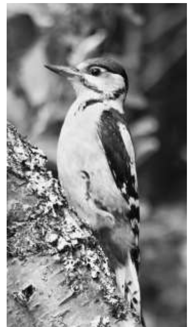
Great Spotted Woodpecker Jon Kelf

I have reminded readers before to listen out for drumming woodpeckers in January and have been listening to them drumming at the boardwalk recently. However, to my surprise when I located the bird vibrating its beak on a piece of dead wood, I discovered that the bird was a female greater spotted woodpecker and not a male bird. I had always assumed in my ignorance that it was only the male birds which drum to announce their territories but a little research revealed that it is both sexes which drum. There is always something to learn in the world of wildlife! Look out for the first butterflies of spring as warm sunny days will entice the first Brimstones out on the wing.