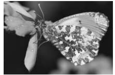
Orange Tip Butterfly Jon Kelf

They are joined by Comma (orange coloured with a ragged wing outline) and Speckled Wood (small brown butterflies with yellow flecks on the wing).