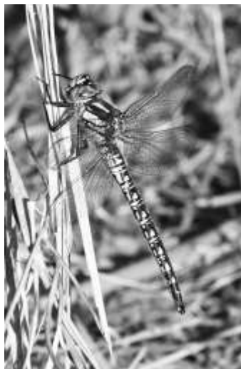
Hairy Dragonfly

So, what can we look forward to in April? Firstly, this is the month to get up early on a still morning and head out to the nearest bit of woodland to enjoy the dawn chorus before the general hubbub of daily life spoils it. Male birds will be singing their hearts out to advertise for a suitable mate and to warn other males that this is their territory. At the start of the month the first Blackcaps will be heard singing along with Whitethroats and Willow Warblers and then followed by the calls of Cuckoos and Common Terns. We will welcome back the first Swallows, Sand Martins and House Martins and at the end of the month hopefully see Little Gulls and Black Terns passing through on