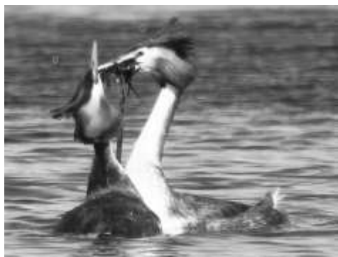
Great Crested Grebe 'Weed Dance' Jon Kelf

The bird of the month for me in May was a Ring Ouzel which spent several days in the garden of a lucky Irstead resident. These are the only members of the thrush family which are a summer visitor to the UK and will pass through Norfolk on migration to northern areas where they live on uplands and are known as mountain blackbirds. The male is similar to a blackbird in colour but has a distinctive white crescent shape on its breast and some grey edges to its wing feathers. They spend the winter in the Mediterranean area, although some will go as far as North Africa.