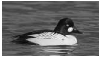
Goldeneye Duck - Jon Kelf

With the exception of a cold week before Christmas, the winter's been generally mild, so once again there's been a lack of winter wildfowl on Barton Broad with the numbers of Coot, Tufted duck, Teal, etc all being low. The Goldeneye numbers have increased to around 40 meaning Barton is one of the best places in the county to see them. Winter swans have also been low in numbers, although there's been a small number of Whooper swans on the Ludham/St Benets marshes and one or two Bewick swans with them. A cold spell in January or February could push a few more of these yellow billed swans over from the continent to swell their numbers.