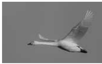
Bewick Swan - Jon Kelf

I was very pleased to see a Short-Eared Owl at Horsey on the 5 th January whilst I was seal wardening. It was my first of the winter and was flying around the bottom of the dunes hunting for voles in the grassland. They are winter visitors to Norfolk and are daytime hunters so they can be seen over marshland habitats on a sunny afternoon flying with a stiff wing action so it almost looks like they are flicking their wings at times. There have been a few individuals at St Benets Abbey this winter but generally their numbers are low this year.