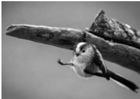
Long-tailed tit

The resident pair of swans appear to have driven away last year's brood of youngsters as the 4 juvenile birds which have been present all winter have disappeared. I was pleased to see a solitary male Pochard on the broad and witnessed a Peregrine drift over and soar above the broad, both of which were new ticks on my '2023 list of birds seen walking from home'. A small group of Taiga Bean geese have been on the grazing marshes at Ludham Bridge, a scarce winter visitor to Britain. I heard my first Skylark singing on the 15 th February on a mild sunny morning and saw my first displaying pair of Grebes the same morning, both good signs of approaching spring.