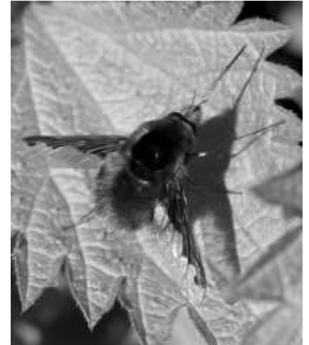
Bee fly – Jon Kelf

On warm sunny days in March look out for the Dark-edged Bee-fly as they hover in front of flowers with a long proboscis, emitting a bee like whine from a brown furry body. Easily confused with a small bumble bee, as is the Hairy-Footed flower bee, which loves tubular flowers like Lungwort, the females being almost black in colour compared with the tawny coloured males.