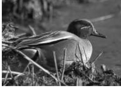
Teal

February has been a quiet month for interesting wildfowl on Barton Broad but Alderfen has had a good number of species with 30–40 Coot, Mallard, Gadwall, Teal, Wigeon, Tufted Duck and Shoveler all being present together with the Mute Swans and Great Crested Grebes.