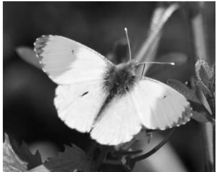
Orange tip - Jon Kelf

interesting sightings just as I have done recently with reports of Fieldfares and Redwings passing through. Another of the delights of spring is of course the dawn chorus and now is the time to get up early and just get out and stand and listen to the woodland birds singing. Will you be the first to hear the Cuckoo, see the first Ring Ouzel on a patch of grass or observe Black Terns passing through on the broad? Warm days in April will