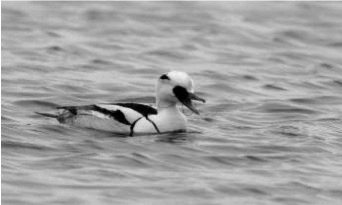
Male Smew - Jon Kelf

March has been much wetter than February in terms of rainfall, but it has still been a quiet month on the broad for wintering wildfowl apart from the ever-present Goldeneye ducks. In contrast the Trinity broads (Ormesby, Rollesby etc) have held both Ring-Necked and Ferruginous ducks as well