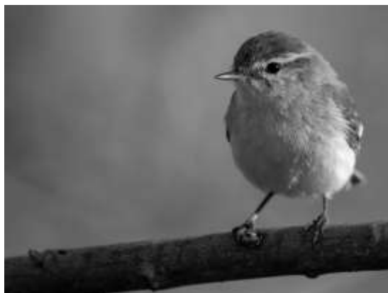
Chiffchaff

As I write this in mid-March, I have already heard the first singing Chiffchaff (on the 18 th ) and look forward to Blackcaps, Whitethroats and Willow Warblers turning up in the next few weeks. One of the joys of migration time in April and May