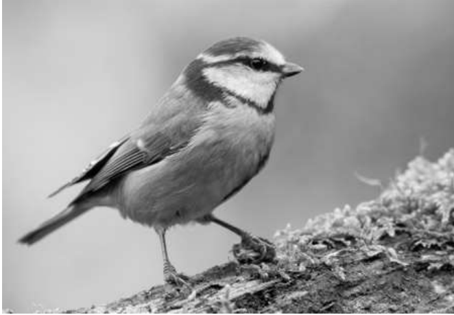
Blue Tit

The good news is that the garden Blue Tits have started making a nest in a box on the garage wall. The bad news is that it is inside a bat box which is, and has been for years, situated just above and to the right of my camera nestbox. Whilst I can see the birds taking beakfuls of grass and moss into the box I won't be able to