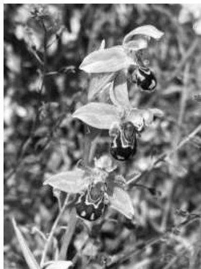
Bee Orchid – Jerry Simpson

I have been contacted by some local residents who have been pleased to find Bee Orchids coming up in their gardens. Bee Orchids are beautiful little plants and are flowering as I write these notes in mid June but will continue into July.