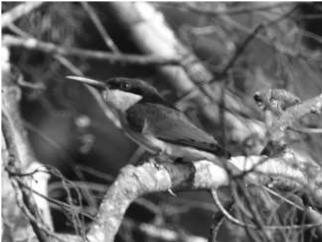
Bee-Eater – Jon Kelf

On a brighter note (certainly plumage wise) some