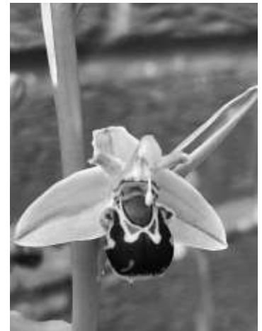
Bee Orchid – Jerry Simpson

The flowers appear on a single spike which may vary in height from 5cm to 30cm and there maybe as many as six flowers although only one or two will be open at any one time. The markings in the centre of the flower mimic a furry bee, hence the name, and is thought to attract other bees to help pollinate the flowers. Recently it has been discovered that Bee Orchids produce a chemical scent similar to ones used by female bees to attract a mate so the bees are fooled into trying to mate with the flower and thereby pollinating it. In England however, many of the plants are self-pollinated and will set seed without the help of real bees.