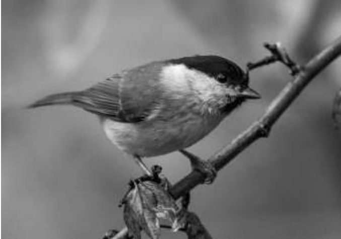
Marsh Tit

During September I was pleased to see a Marsh Tit appearing in my garden and visiting my