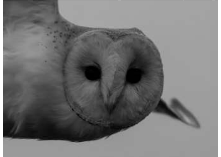
Barn Owl

Over the past couple of years I have been seeing less Barn Owls in our villages and from speaking